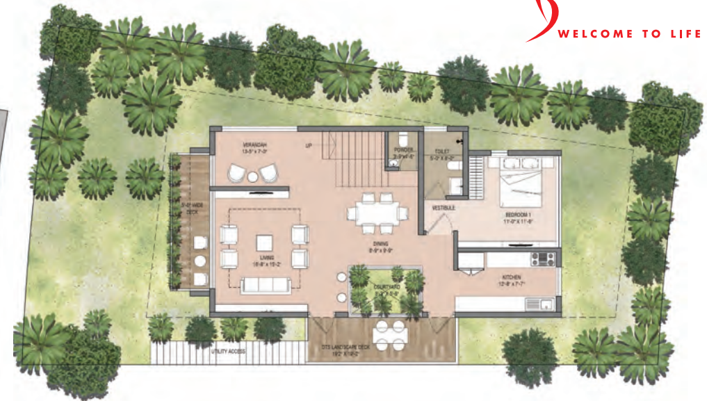
UP HILL- LEV 01 - 1046 SQ.FT.