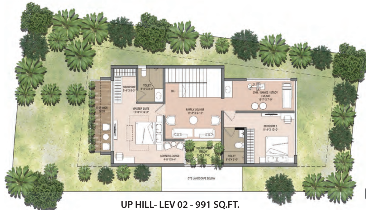
UP HILL- LEV 02 - 991 SQ.FT.

Deck / Balcony Area = 175 SQ.FT. (Covered)