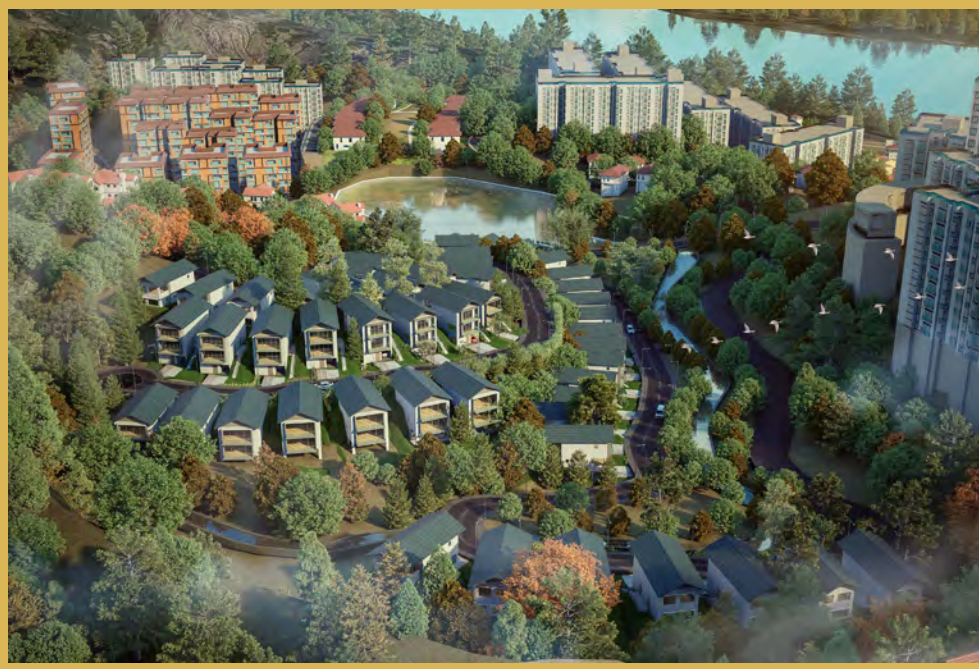
Lake-facing Chalets amidst greenery