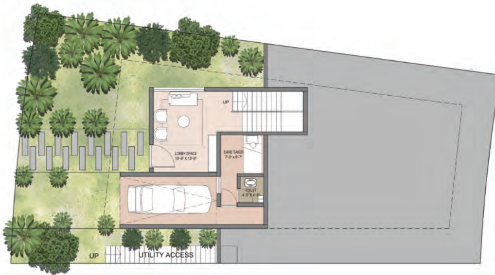
UP HILL- LEV 00 - 516 SQ.FT.